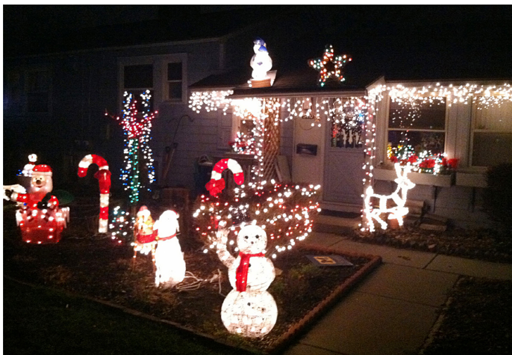
2012 Holiday lights. Join the fun this year with Pittsfield Village's decorating contest!