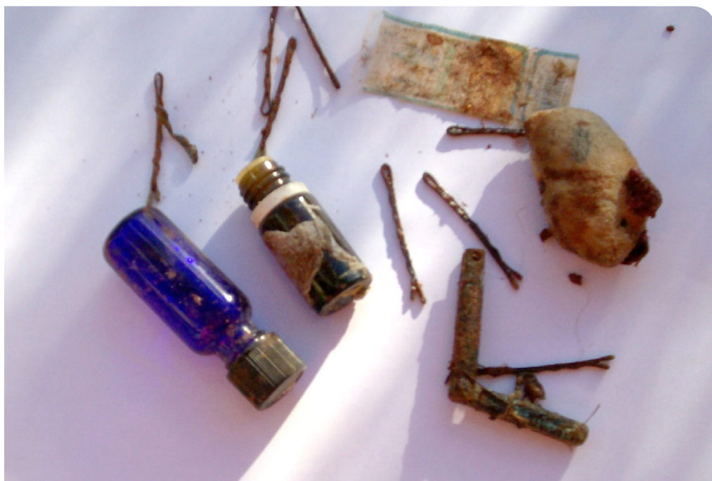
Maintenance found these items in a home's drain.

The problem of clogged pipes and sewer lines is not unique to the Village. For more reading on this matter, Google "London fatberg". Over the summer the sewers of London were clogged with a mass of wipes and grease the size of a London double deck bus. Ewwwww, but at the same time you just want to look.